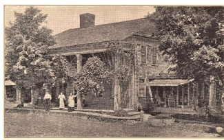
Wessell's Hotel, Carlisle, N. Y., Built in 1808.

One-Room Schoolhouse #5 At one time, the Town of Carlisle had nine one-room school houses, of which our most visible is School House No. 5 at the corner of Crommie Road and Route 20. The school appears on an 1872 map of Carlisle and was closed in 1956. Its school bell, built by the McShane Foundry in Baltimore, Maryland was purchased in 1891 and now resides in Carlisle's Town Hall. The schoolhouse is in a state of disrepair, but passersby can still appreciate its structure and its nostalgia. Please observe it from the street or sidewalk, as it is privately owned and not open for tours.